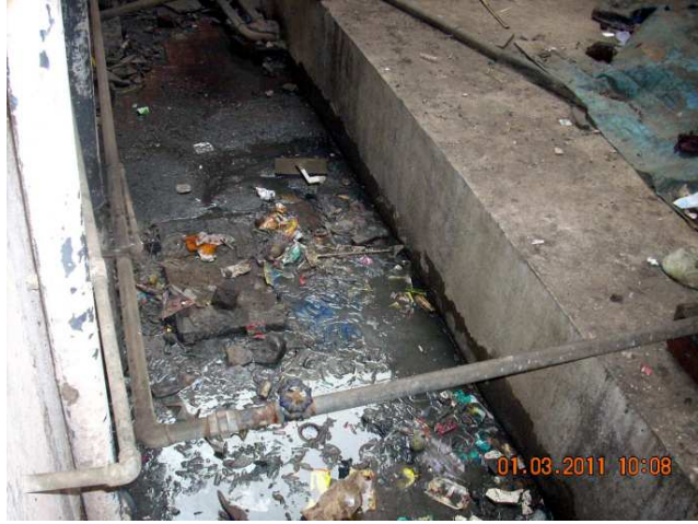
Here, the water-tank is higher -- a good thing, because the sewage is overflowing and forming a puddle next to the drinking water tank.

Underneath this layer of filth is the water-tank and the sewage chamber, side-by-side. There is a rule that the sewage chamber should be 1.5 metres from the building, so that the foundations are not eroded. There are rules and regulations that water supply and sewage chamber must be kept apart, and that water-supply tank must be substantially above ground level. As you can see, all these rules have been overlooked by both RNA Corp and MMRDA..