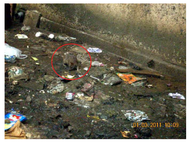
There is a thick layer of filth everywhere. Rats such as the one circled move freely between water tank and sewage tank, as there are holes in both.